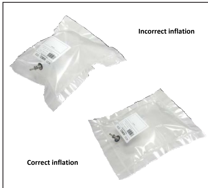
Figure 3. Bag Inflation

To begin sampling, open the valve on the bag fitting; refer to bag operating instructions. Turn on the pump and note the start time and any other sampling information. Avoid filling a bag more than 80% of its maximum volume (Figure 3).